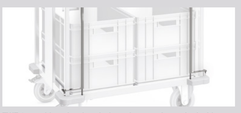
TWE 6 x 4 with optional push-through protection on both sides